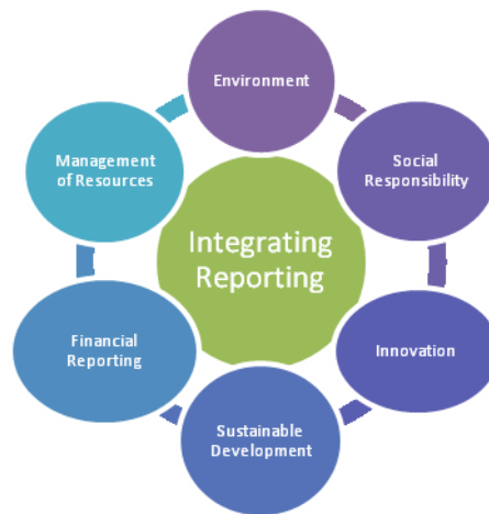
Figure 1: The process of integrated reporting